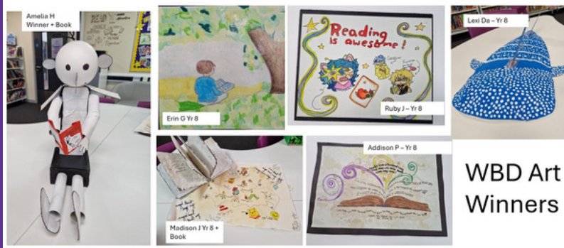
WBD Art Winners

Year 8 really excelled in the World Book Day Art Competition. Wonderful talent! Bendigedig!