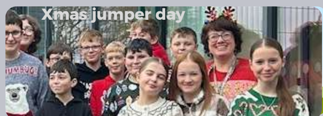
Xmas jumper day

"What an amazing first term it has been for Year 7! We are all so proud of how successfully you have all navigated this period of transition to secondary school at Cwmbran High. There have been some tears, but plenty of laughs, as you have found your way around the school site, experienced many different lessons and teachers, and made new friends. It has been an absolute pleasure getting to spend time with so many of you during this term. Now it's time for some rest and recuperation, and I look forward to 2026 and what the new year will bring for each and every one of you."