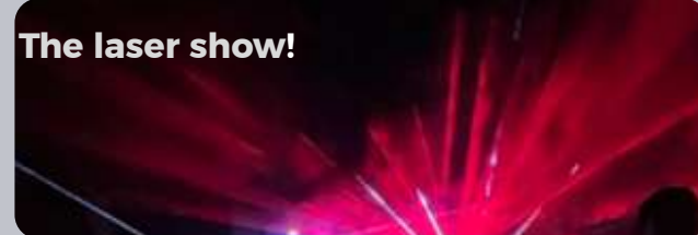
The laser show!